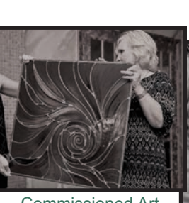
Commissioned Art dedicated to our Founders